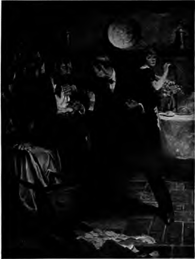
HARD KNUCKLES PRESSED CRUELLY INTO THE SOFT THROAT OF THE VILLAGER ( page 62 )